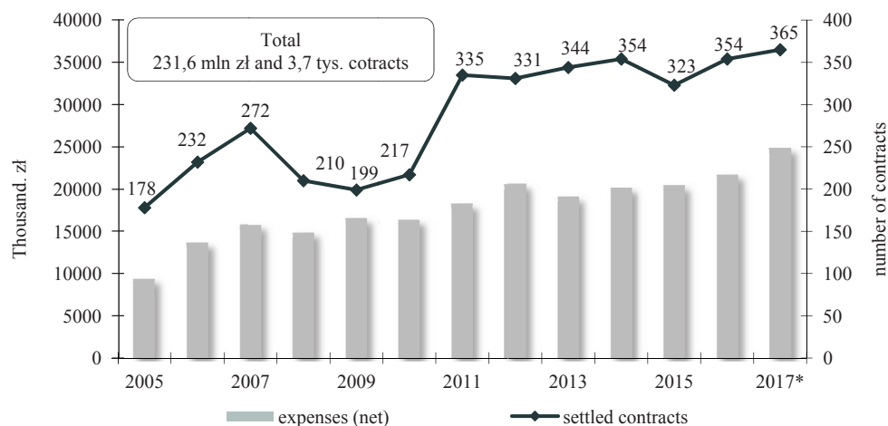
Fig. 2. Implementation of the market support for bee products in 2005-2017

Source: Report on the activities of the National Center for Agricultural Support