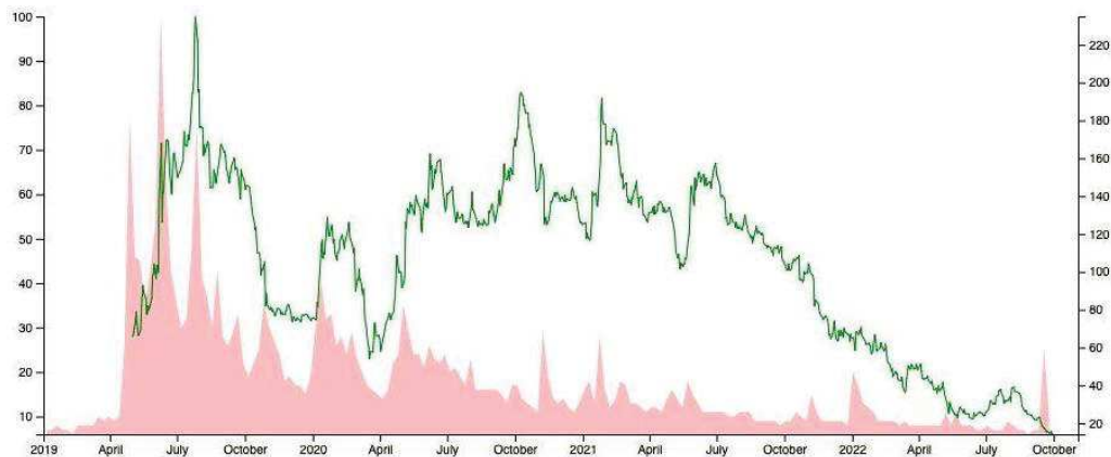
Fig. 1. Price of the Beyond Meat stock prices since its Initial Public Offering in 2019 as compared to Google Trends

its sales continue to drop, causing a nearly 100 million USD revenue loss (Just Food, 2022). As the cost-of-living crisis prevails, cheaper meat is blamed for the continued drop in plant-based meat alternatives. The sale of Beyond Meat products has been discontinued by several fast-food chains, such as Dunkin Donuts or Hardee's, due to the lack of demand (Fox Business, 2021; Reuters, 2022). Due to the losses, the company decreased its workforce by over 1000 (ca. 4% of its total workforce). Figure 1 depicts the stock market prices of Beyond Meat since its Initial Public Offering (IPO) as compared with the Google Trends presence (treated as a proxy for the media presence, as well as the retail investor interest).